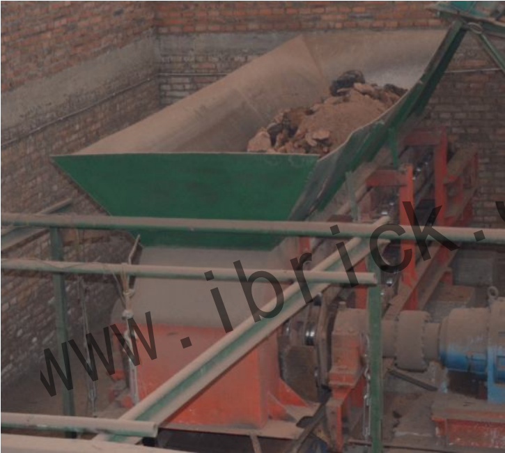
Feeding materials by rotational aluminum plate