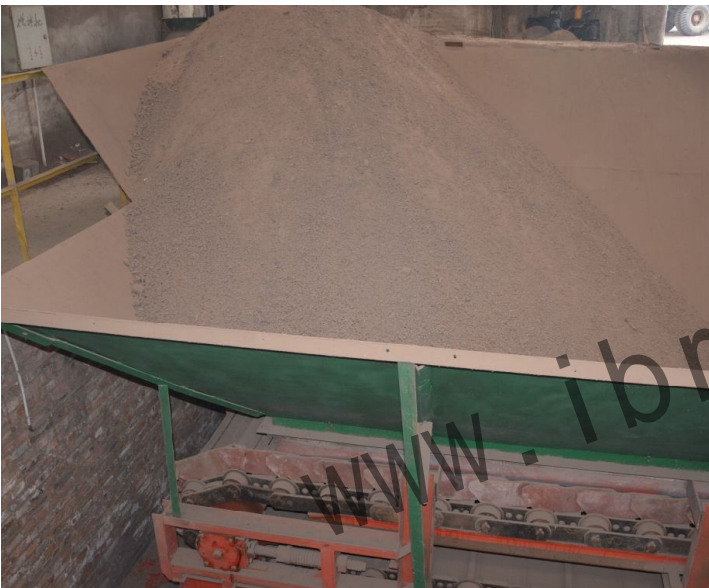
Store the materials in short-term.