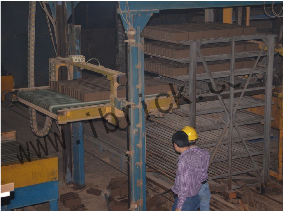
Stacking the grouped bricks on rack