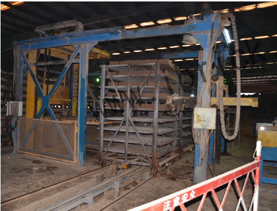
On-off rack equipment