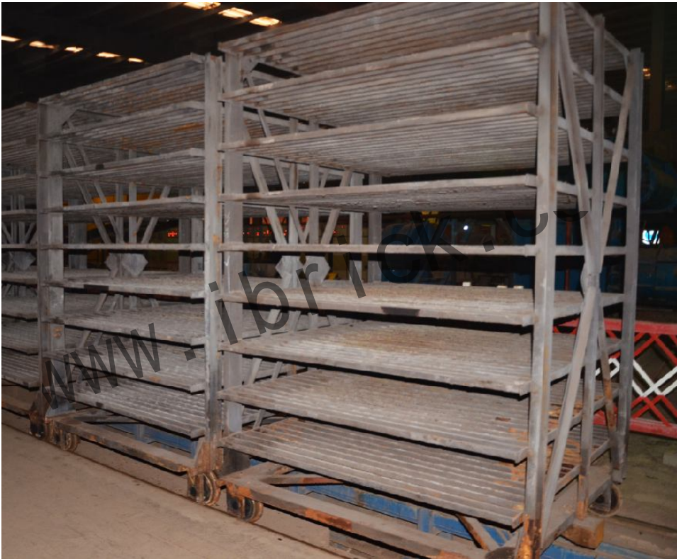
Drying shelf and drying pallet