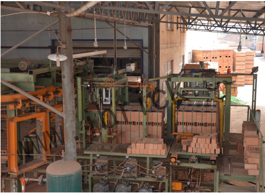
Pack the bricks with packing machine