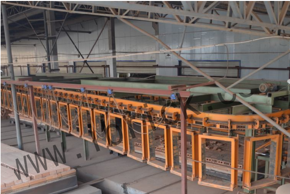
Pallet of bricks