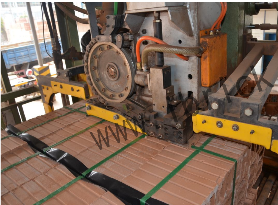
Pack the bricks