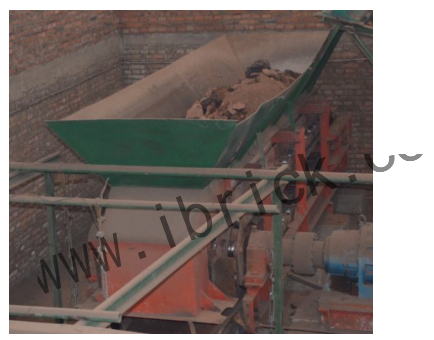
Feeding materials by rotational aluminum plate